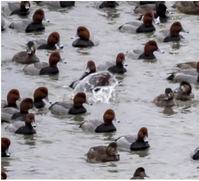
Redheads making a splash

the best viewing ever of one for most of us.