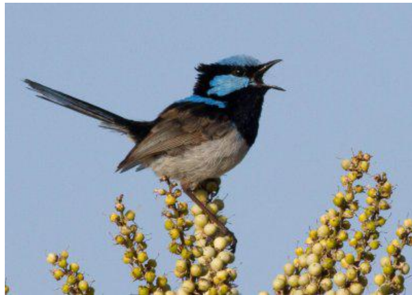
Superb Fairy-Wren (Ton Schat)