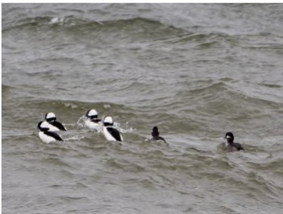
Buffleheads in Choppy Water

We moved on to the southwest side of the lake to view an even larger raft of about seven thousand ducks from Elaina McCartney's property. We had excellent light, and picked out Ring-necked Ducks, both species of Scaup and a few Canvasbacks among the thousands of Redheads. The changing shape of the raft was fascinating to watch as the birds were constantly shifting position. Hooded and Common Mergansers, American Black Ducks and Mallards and a single female Bufflehead were also seen well. Songbirds at the bird feeders entertained us here.