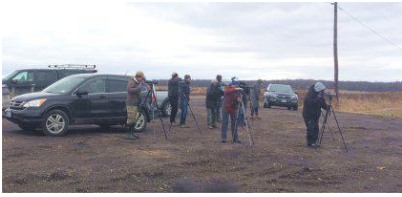
At the Mucklands