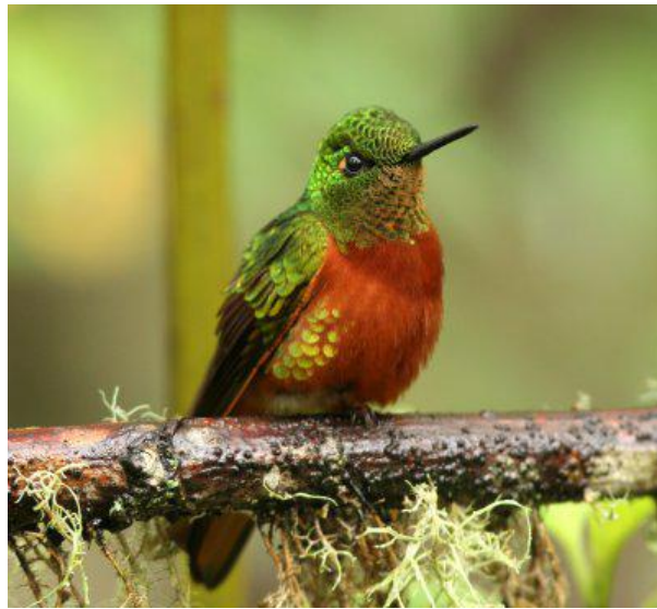
Chestnut-Breasted Coronet (Jared Dawson)

The wind on the east side of the lake was very strong, and we only spent a few minutes at East Shore Park, where Common Goldeneye were bobbing in the waves. We found two Common Loons and more Goldeneye at Ladoga Park. A stop along Lake Road, south of Aurora, yielded a small flock of Dark-eyed Juncos, a Carolina Wren, and surprisingly, a juvenile White-crowned Sparrow. Two adult Bald Eagles flew close by, one with a large stick in its talons. Later, from Aurora Bay boathouse, we could see two Bald Eagles actively moving about their large