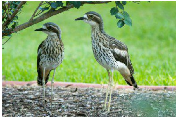
Bush Stone-Curlews