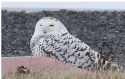
Snowy Owl at FL Airport

By mid-morning we arrived at the Seneca Stone Quarry hoping for the visiting Gyrfalcon (no luck there). We did get a great look at a Snowy Owl on the runway at the local airport and then headed over to Cayuga Lake for a few more ducks.