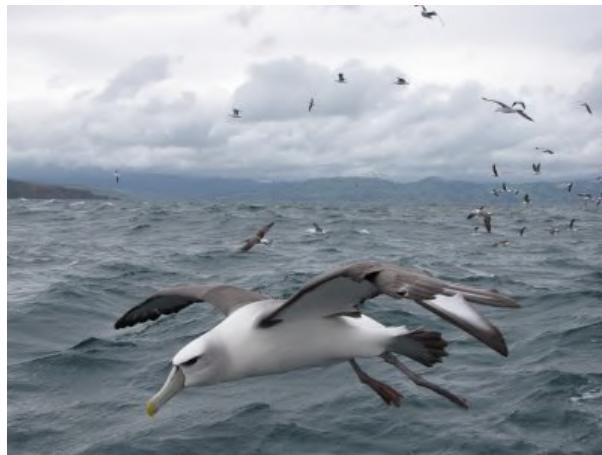
White-Capped Albatross (Lindsay Goodloe)