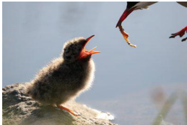
Arctic Tern (Kevin McGowan)